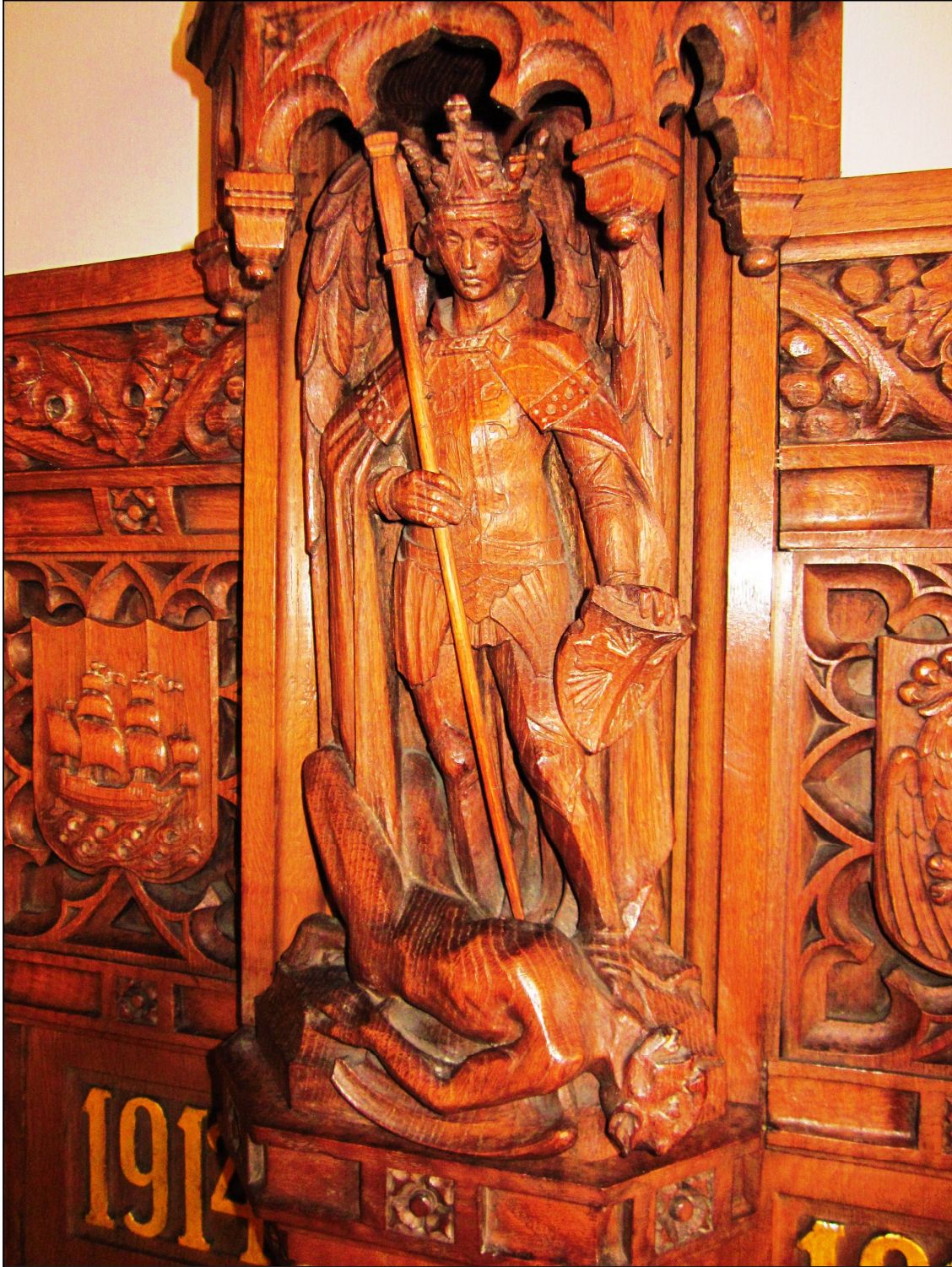
The central motif above the War Memorial: St Michael slaying the Devil