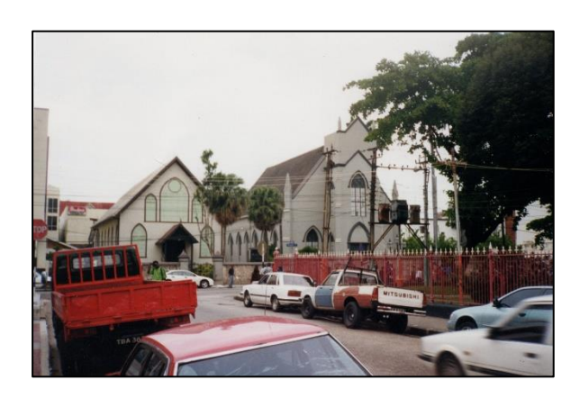
Greyfriars/St Anne's Church and Hall

Well, what was the problem? Trinidad is situated far to the south of the Caribbean, and you can in fact see the coast of Venezuela from the coast of Trinidad. It is over 1,500 miles from the nearest Church of Scotland, which is to the north in Bermuda. The Board of World Mission in Edinburgh had resolved that it made sense to merge the Greyfriar's/St Anne's congregation into the Presbyterian Church of Trinidad and Tobago. Well, many of you may remember the Cuban missile crisis in the 1960's - that had nothing on this!