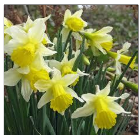
The Lent Lily