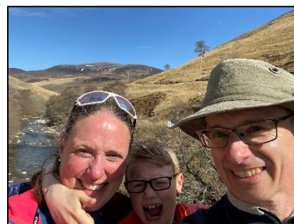
Springtime in Glen Tilt!

The spring has come, New people are the flowers of it. Through wind and rain, new life is in the showers of it. New bud, new shoot, new hope will bear the Spirit's fruit. New bud, new shoot, the spring has come, new people are the flowers of it. (Shirley Erena Murray)