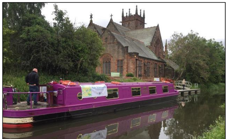
A canal boat moored at the church in 2019 to test the idea

Currently being built by New and Used Boat Co, the boat will serve as a safe space to gather, socialise and improve wellbeing. It will also host People Know How's projects supporting children, young people, families and adults, while providing work or volunteering experience for the people who maintain it.